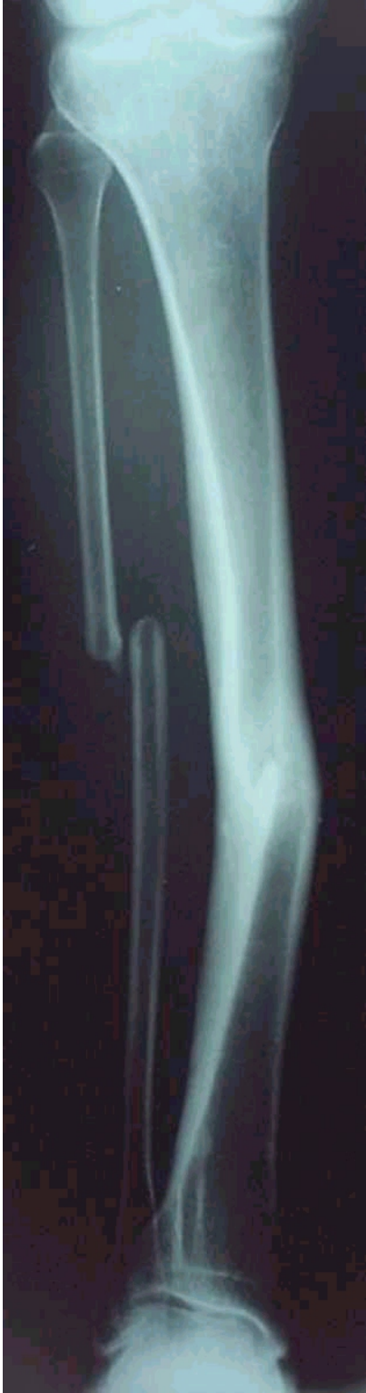
Figure 1: Right leg from knee to ankle.