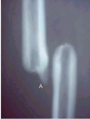
Figure 2: Disjuncted right fibular ends with small bony callous (label A).