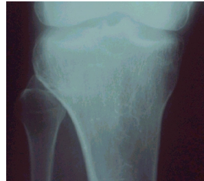
Figure 4: Corresponding degenerative changes at the right knee.