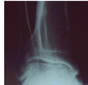
Figure 5: Corresponding degenerative changes at the right ankle.